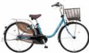
City Bicycle with Electric Power Assist Model 26 inches, 3-speed gear Range 70km

1 minute walk from West Exit of Joetsu Myoko Station