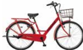
City Bicycle Model 26 inches, 3-speed gear