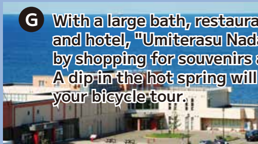
G With a large bath, restaurant, fresh fish market, and hotel, "Umiterasu Nadachi" will satisfy you by shopping for souvenirs and dining. A dip in the hot spring will relieve the fatigue of your bicycle tour.