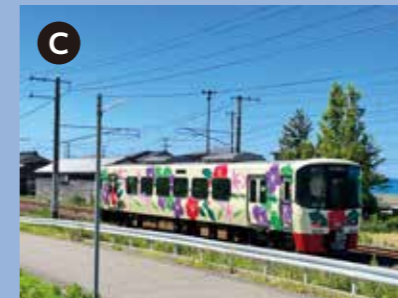
C Enjoy the railroad scenery from the Tanihama Tetsumi Deck, which was built to view the railroad.