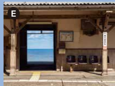
E Arimagawa Station is popular for its old station building and sea view.