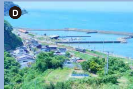
D The view of the Sea of Japan from Tanihama Park on the hill is spectacular.