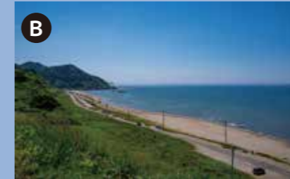
B Gotsu Coast with its beautiful sea scenery that appears as you pass through the town of Naoetsu.